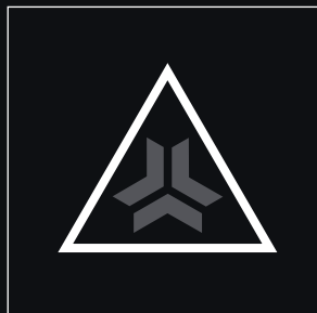
TRIANGLE = STRENGTH